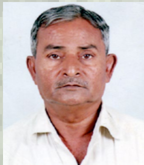
Shri. Bharatbhai M. Barad Hon'ble, Mayor, Bhavnagar